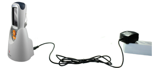
With Single Slot Dock