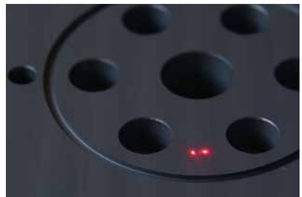
Twin beams for easy focus finding