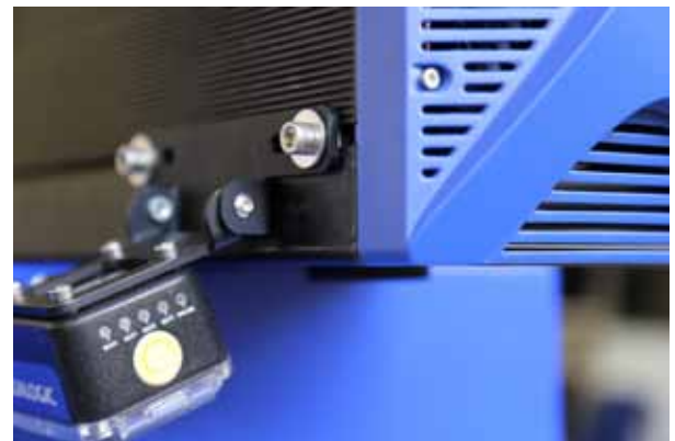
EasyFix mounting rail for accessories