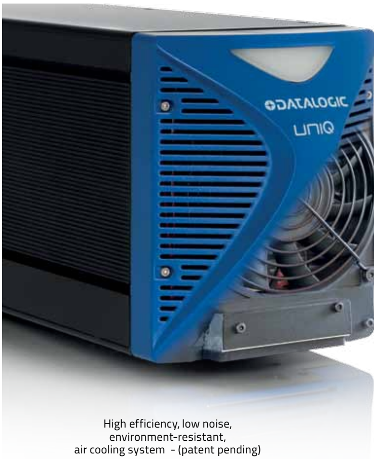
High efficiency, low noise, environment-resistant, air cooling system - (patent pending)

Laser interaction with organic or inorganic material can cause TOXIC FUMES/PARTICLES. The OEM laser components described in this product guide is for sale solely to qualified manufacturers, who shall provide interlocks, indicators and other appropriate safety features in full compliance with applicable national and local regulations.