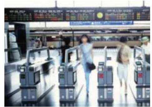
Access control and Ticketing