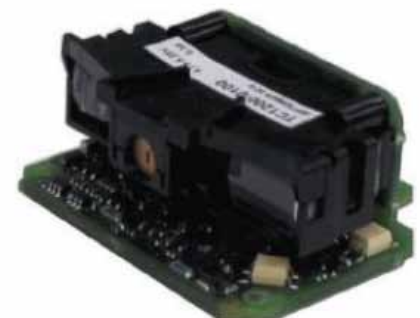
TC1200 SCAN ENGINE MODEL