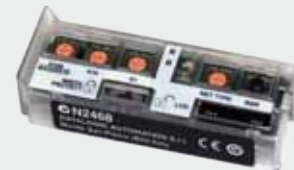
BM100 Backup Module