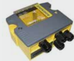
CBX100LT Connection Box