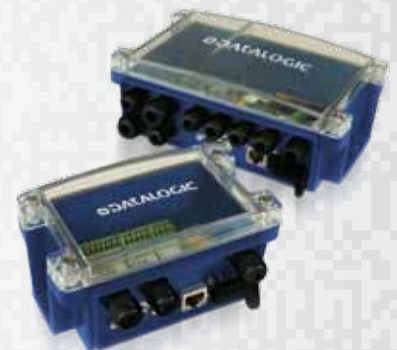
AL5010 INTERFACES MODULE